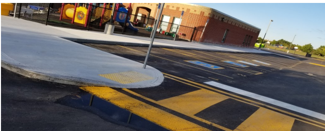
Speed bumps/ Cross Walks