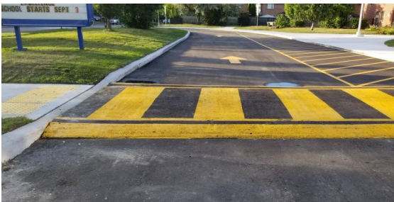
No Parking—Through Lane