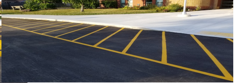
No Parking—fire and bus lane